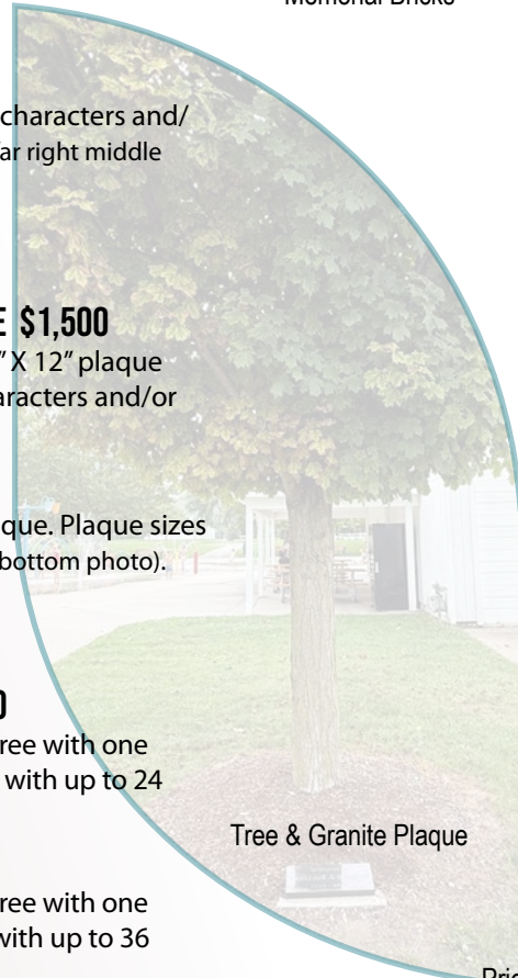
Tree & Granite Plaque

Includes your choice of one native shade tree with one 8" x 16" granite plaque including five lines with up to 36 characters and/or spaces (right photo).